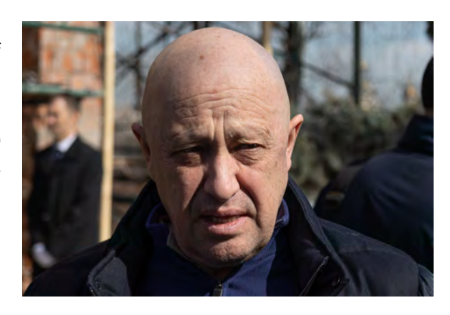
Yevgeny Prigozhin

Prigozhin has been indicted and sanctioned numerous times by the U.S. Department of Justice and the U.S. Department of the Treasury for charges ranging from interfering in U.S. elections to his role in the Ukraine war.<sup>20</sup> Wagner's operational commander, Dmitry Utkin, is a former Russian special forces ( Spetsnaz ) soldier in the Main Intelligence Directorate (GRU) with combat deployments to Chechnya in both the First (1994-1996) and Second Chechen War (1999-2000).<sup>21</sup> The Wagner Group's motivations are a mix of