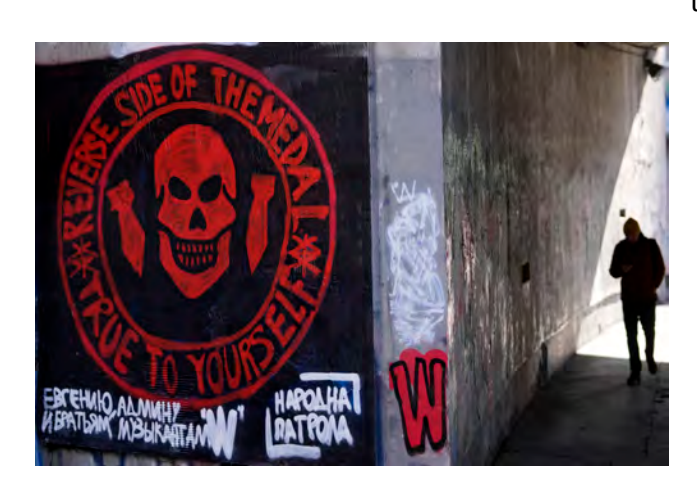
A man walks by a drawn again mural depicting the logo of Russia's Wagner Group on a wall in Belgrade, Serbia

late May. In many ways, Wagner's role in the Bakhmut fighting represents a microcosm of Wagner's wider activities in Ukraine. As a fighting force, Wagner produced more gains in Bakhmut than the conventional Russian military, yet the group has sustained significant losses by doing so. Prigozhin has spoken multiple times on the dire state of Wagner's affairs in Bakhmut, noting that his group risked encirclement by the Ukrainian Armed Forces. According to a February 2023 White House assessment, the Wagner Group has sustained more than 30 thousand casualties since the beginning of the conflict. According to Prigozhin, 20